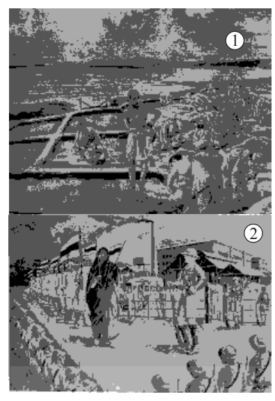
Fig 11 B.2: Two posters printed during freedom strugle: 1. Gandhiji at Dandi collecting salt, 2. Sarojini Naidu marching in front of Darshana Salt factory.

for the common people) by manufacturing salt at Dandi, a small village on the Gujarat sea-coast. The next morning Gandhiji and his 78 companions began the 375 km trek. from Sabarmati Ashram to Dandi. This was covered in 24 days. Day after day newspapers reported his progress, his speeches and the impact on the people Hundreds of village officials on his route