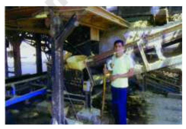
Fig 11.4 Labourer at chipping machine Free Distribution by Govt. of A.P.