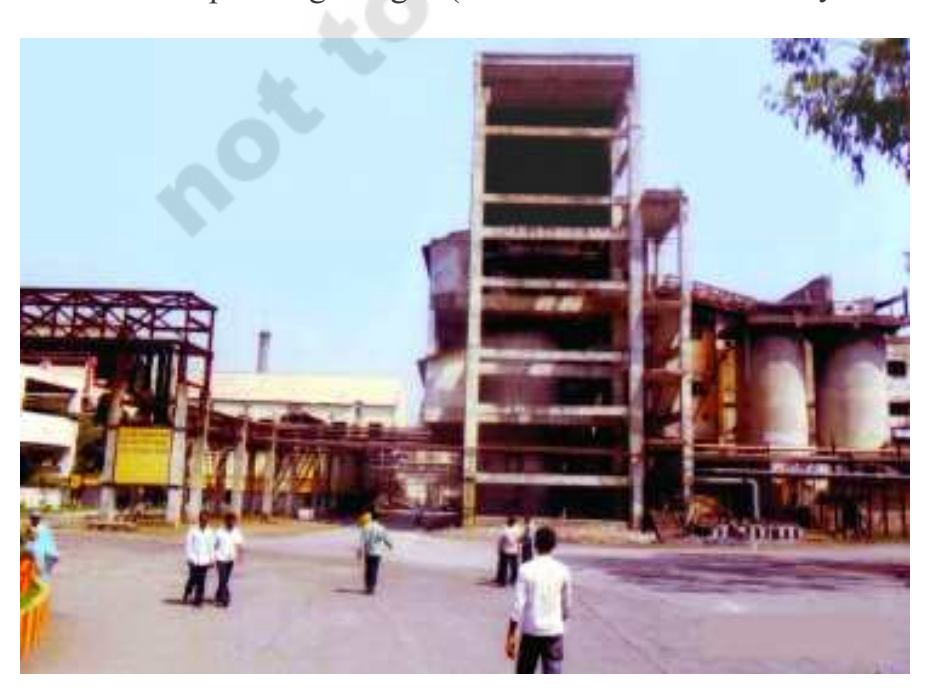
Fig 11.1 Factory from outside

Materials required to produce a commodity are called raw materials.