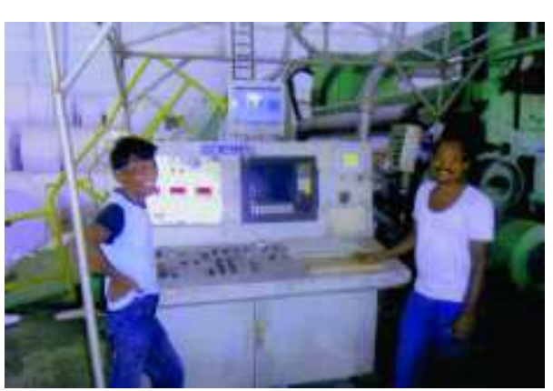
Fig 11.5 Labourers at setting machine

Production in a Factory - A Paper Mill 99