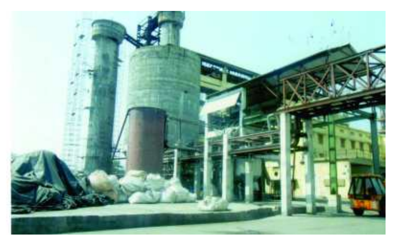
Fig 11.6 Pulping machine (Fiber line)

Through this process the wood chips are turned into thin fibres (like cotton fibres). The liquid pulp is then whitened using chemicals. Then it becomes creamy. We found the liquid pulp in milky white colour without any dust.