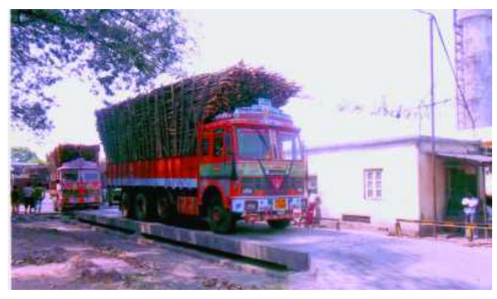
Fig 11.2 Lorries waiting with bamboo loads

Factories require large and continuous supply of raw materials. You will find dozens of lorries supplying raw materials to them every day. Paper mills generally use wood from bamboo, eucalyptus and subabul trees. Subabul wood is most widely used now. Besides wood a large number of chemicals such as common salt, caustic soda and so on are also used in different stages of paper making. Scrap paper is also recycled in paper mills.