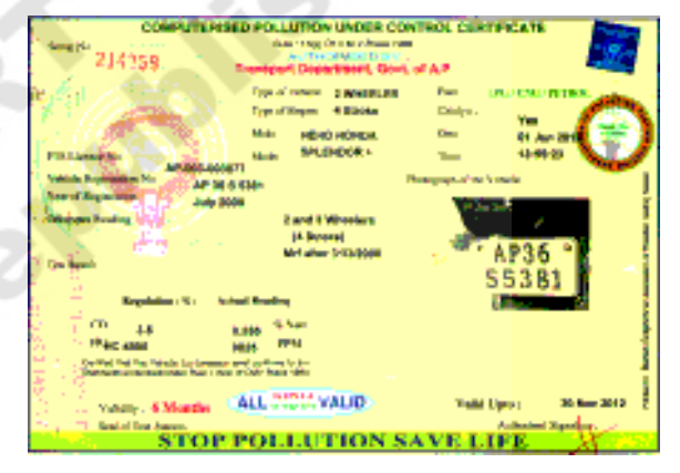
Fig-2 Pollution certificate

In the evening when Satyam returned home, Akshay wanted to see the pollution under control certificate. You can also see that certificate. Here it is.