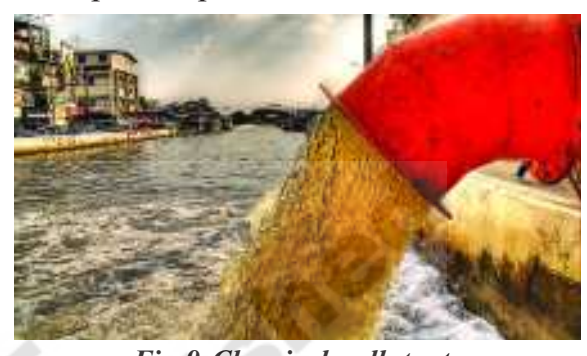
Fig-9 Chemical pollutants equipment is another reason. Fish and plants require certain temperatures and oxygen levels to survive. So thermal pollution often reduces the aquatic life diversity in the water.

Thermal pollution can be natural, in the case of hot springs and shallow ponds in the summertime is also a reason for increasing temperature in water. The discharge of water that has been used to cool power plants or other industrial