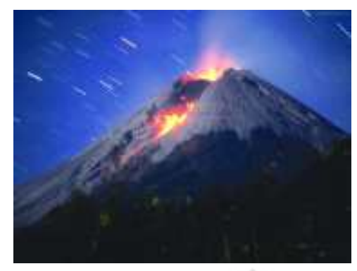
Fig-3 Volconic eruption